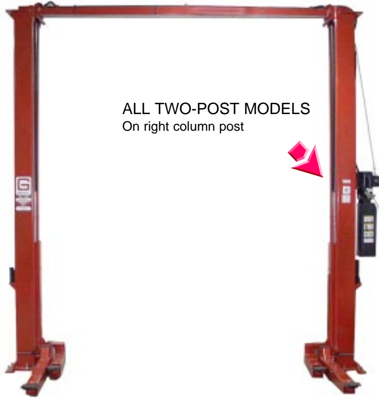
ALL TWO-POST MODELS On right column post