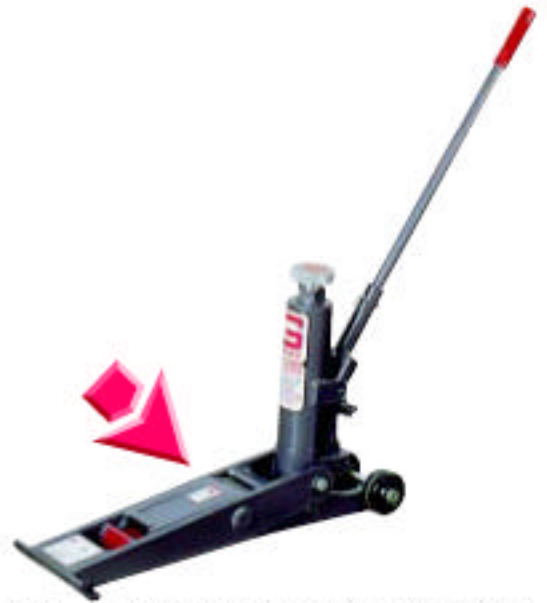
MODEL FLJ-400B / FLJ-400 / FLJ-400A Located on frame