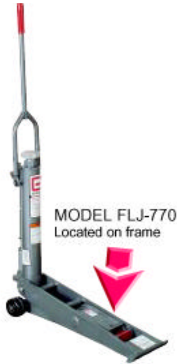
MODEL FLJ-770 Located on frame