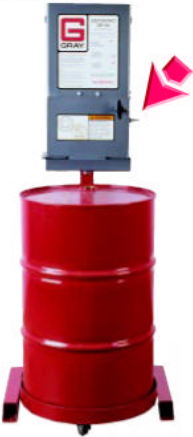
MODEL QP-50 Located inside door