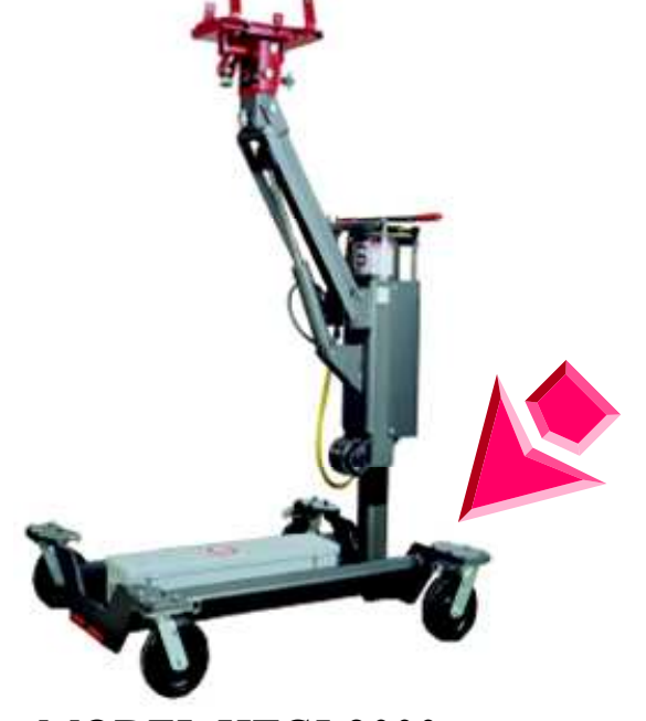
MODEL HTCJ-2000 Located on back right caster bracket