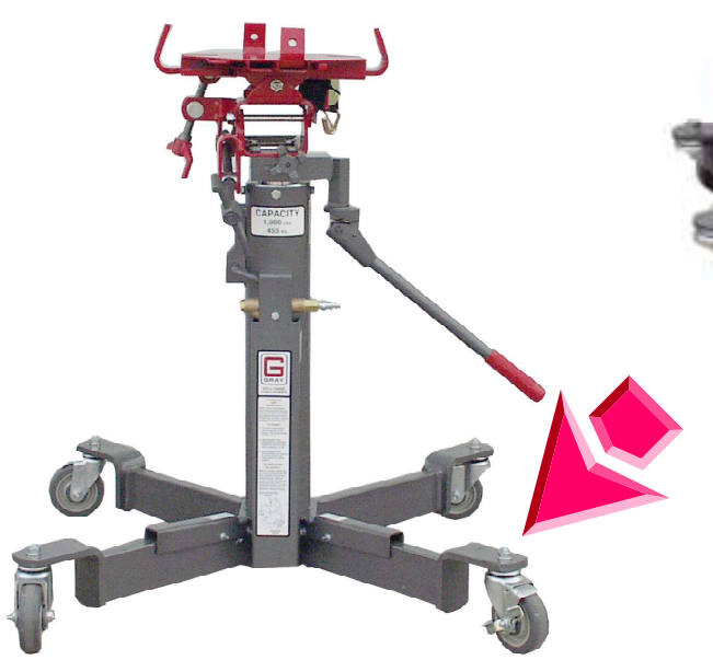
MODEL TCJ-500 Located on front left caster bracket