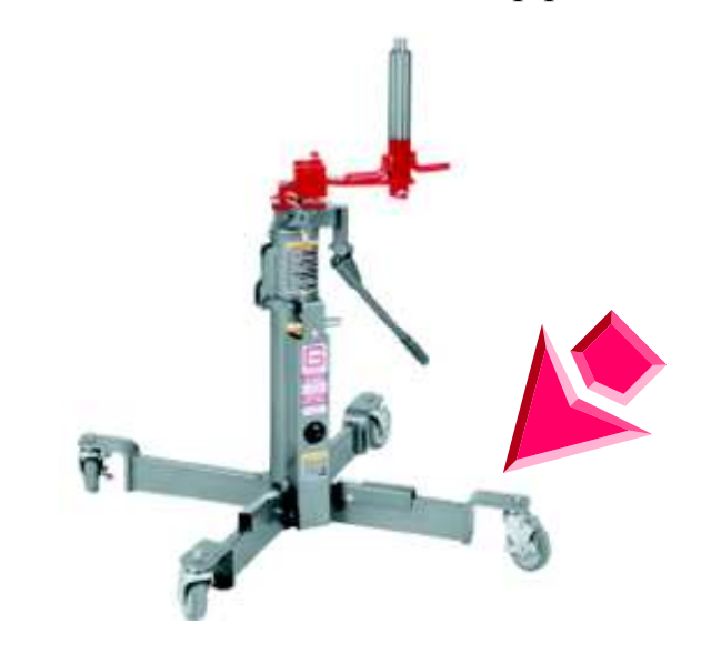
MODEL HR-300 Located on caster bracket of up pedal