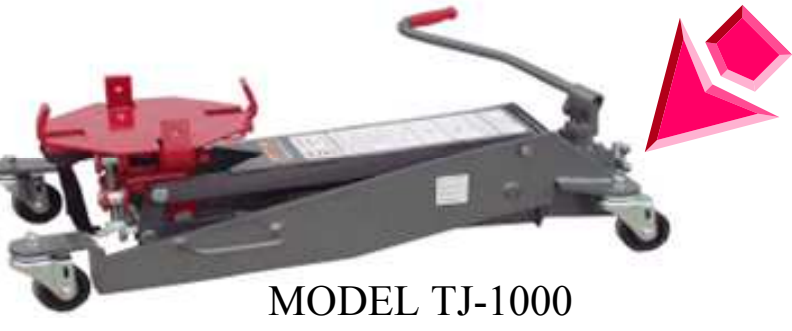
Located on frame next to hyraulic unit